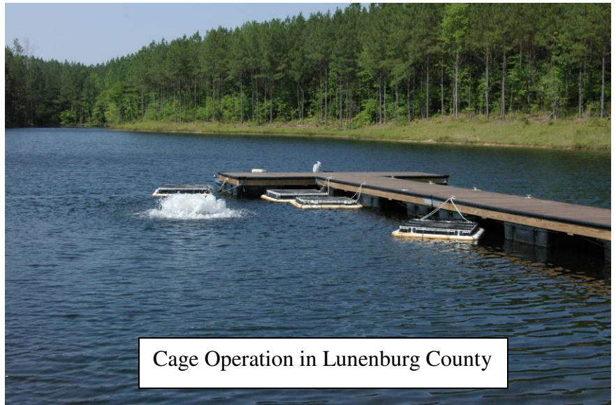
Cage Operation in Lunenburg County

The simplest cage that can be built is a round cage that is 4 ft in diameter by 4 ft in depth. This type of cage runs about $60-$80 each for materials. Cages can come in different sizes and designs. A 4 x 4 x 4 ft square cage is commonly used but is more costly to build than a round cage. A 4 x 4x